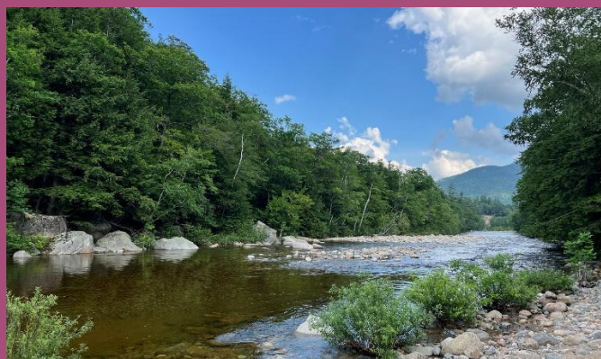
White Mt. National Forest.

An occasional column featuring readers' reverent observations of our natural surroundings