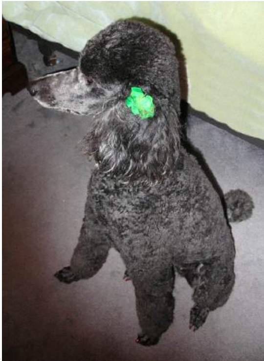
Winnie. Some "people" just know how to accessorize. Green hair bow, pink nail polish, and Weare dog license.

Questions can be directed to the Town Clerk's office at 603-529-7527 or pmoul@wearenh.gov