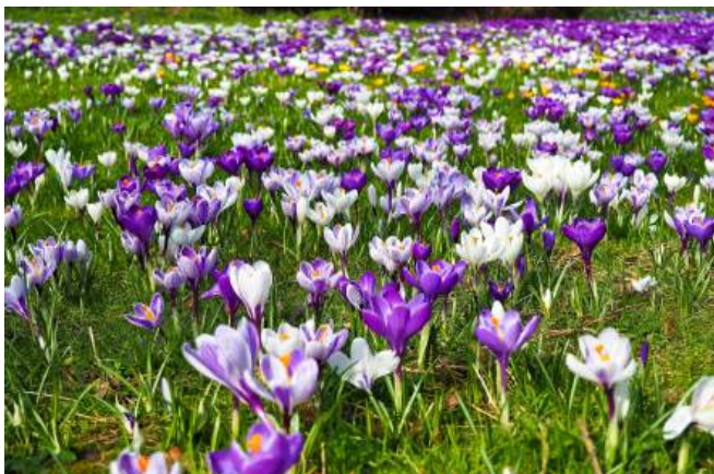
Spring Crocus. Pixabay.