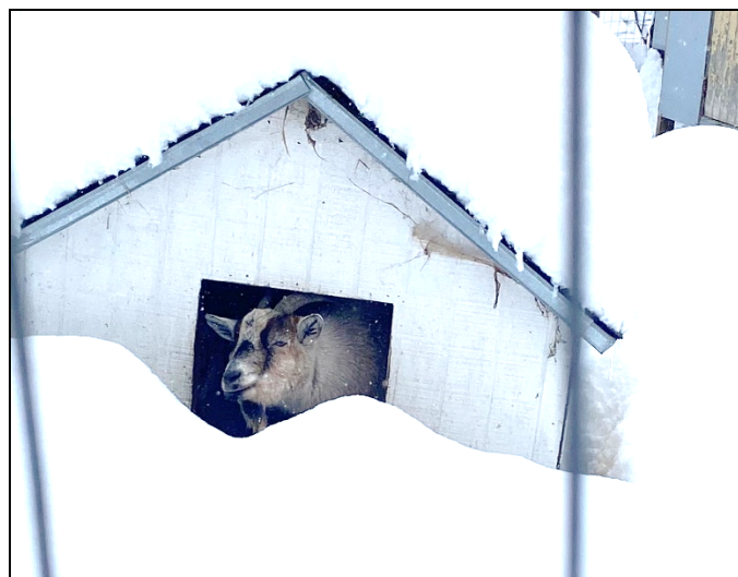
"Whisper the Goat" waits patiently for someone to shovel a path (Nicole Czarnecki photo). For more "Why We Live in New Hampshire" pictures, see pages 7 and 8.