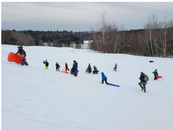
Pack 24 Cub Scouts are shown hiking up a hill at Stonebridge Country Club in Goffstown. For more Scout news, see page 4.