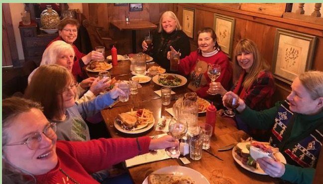
Garden Club Christmas lunch and Yankee Swap. Who says gardeners don't know what to do with themselves in the winter?.