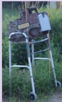
Spotted in Maine (Val Bartholomew photo).