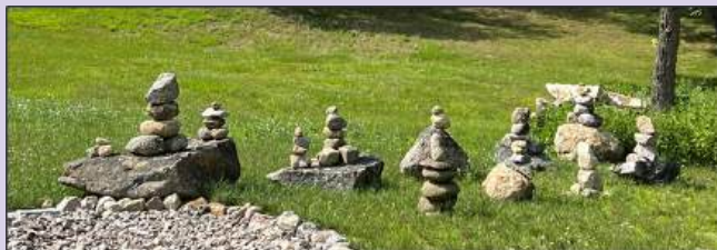
Rock cairns in Henniker.