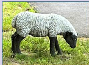
Sheep ornaments in South Weare.