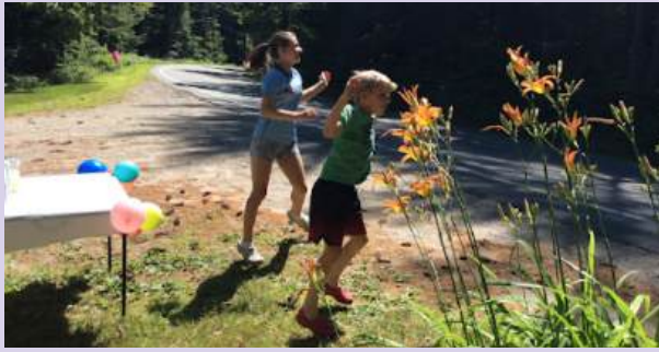
Lemonade stand enthusiasm!.