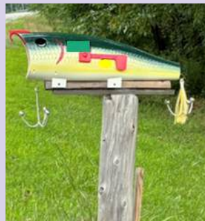
An "alluring" mailbox.