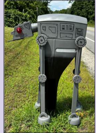
"Air Mail" in South Weare and a Star Wars "AT-AT" in Bedford.