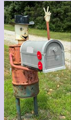
From Weare Center.