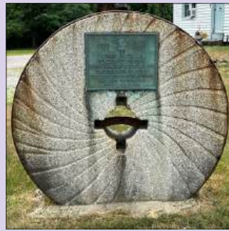
Pine Tree Riot memorial stone.