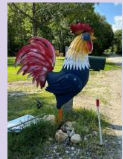
A rooster awaits the mail.