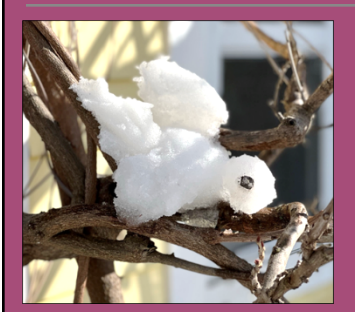
"Snow Bird"