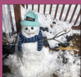
"Deck Snow Person'