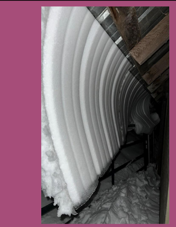
Metal roof tunnel (Joe Czarnecki photo).