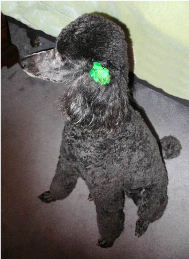
Winnie. Some "people" just know how to accessorize. Green hair bow, pink nail polish, and Weare dog license.

Questions can be directed to the Town Clerk's office at 603-529-7527 or pmoul@wearenh.gov