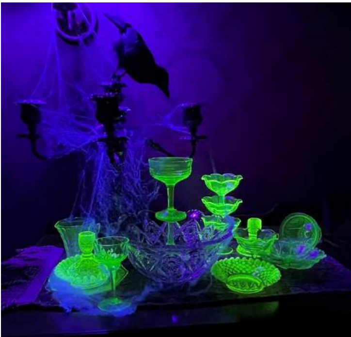
Uranium Glass & Black Light