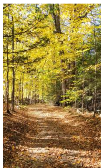
Yellow Woods.