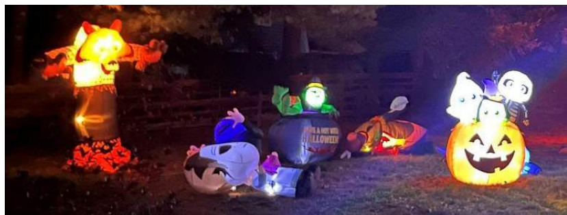
Old Town Road Weare