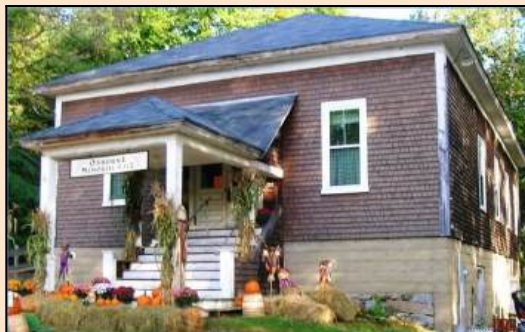
Rain or Shine (lower floor)

Osborne Memorial Hall 16 Deering Ctr. Rd. (Rte. 149), Weare