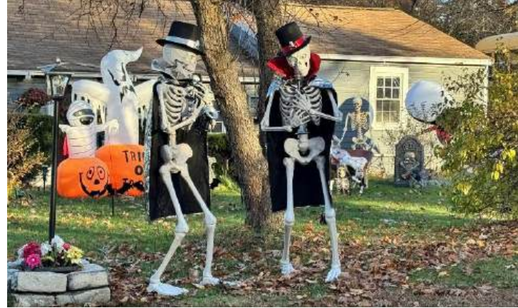
Thorndike Road Weare