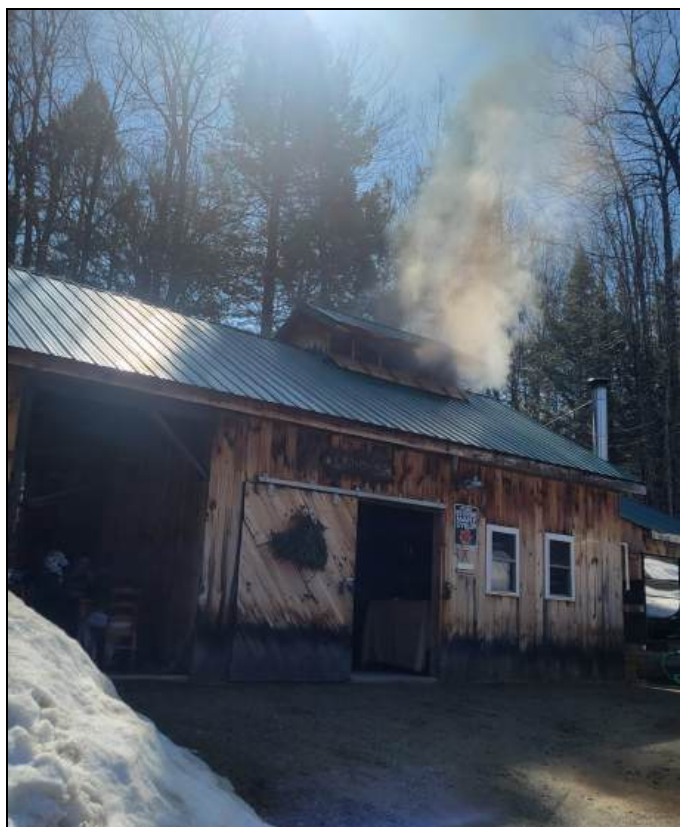
Kaison's Sugar House in Weare boils sap on "Maple Weekend".