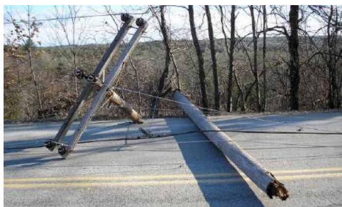
Reminder of bygone windy days.

Thank you, people of Weare, for your generous donations to the yellow shed that sits in the parking lot of Holy Cross Church. Your donations of used clothing to the shed in 2024 amounted to 45,724 pounds. This was enough to clothe an estimated 8,423 people all over the world. Just imagine where your shirts, coats, pants, dresses might be today, providing much needed clothes for those less fortunate than us. Additionally, your donations saved the transfer station that many pounds of materials that would have ended up in the compactor. Holy Cross thanks you again, and please keep feeding the yellow shed.