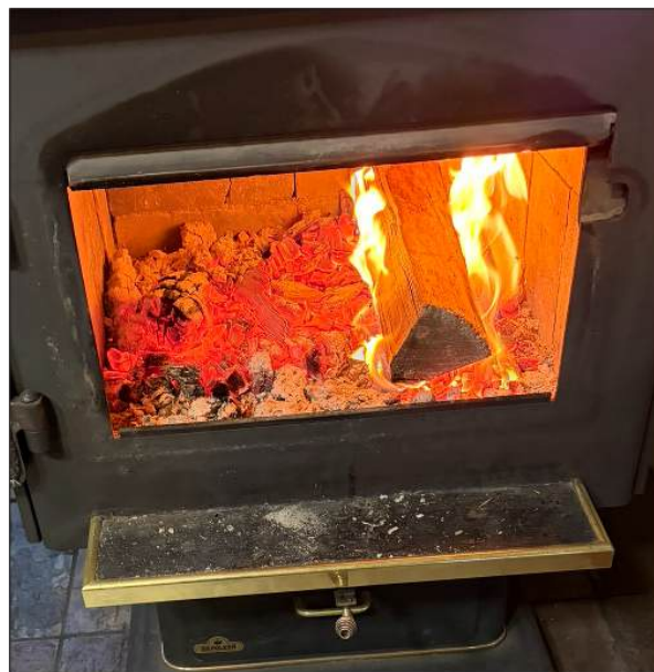
Dancing Sea Horses Keeping Warm.