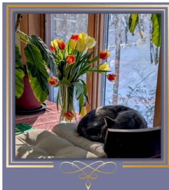
Dreams of Spring.

For more information call 224-9909, or visit www.nhaudubon.org .