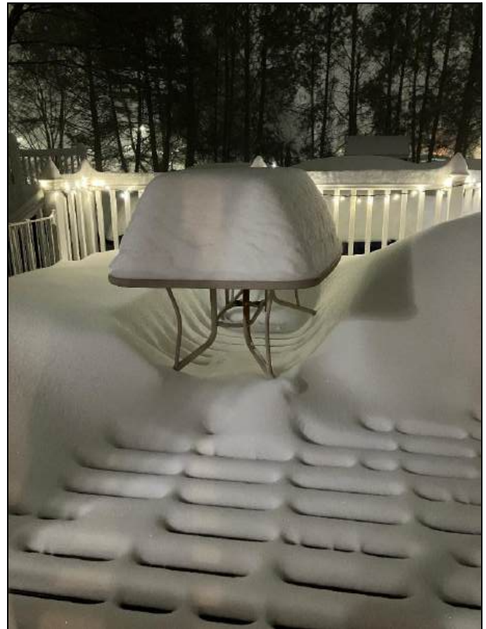
Snow & Shadows.