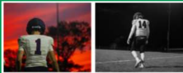
L: Chase Lansford (11), Photography, Honorable Mention R: Chase Lansford (11), Photography, Honorable Mention