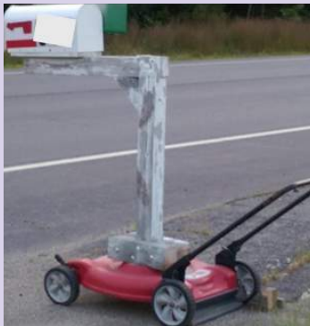
"Mail on the Move." Spotted by a reader on vacation in Central Maine.

My mom and dad built our lake house back in the seventies, providing us with so many wonderful memories on Lake Horace. Our boys and their families continue to share their love of the lake house! In memory of my parents, the "kids" gave us the butterfly lawn ornament as a tribute to their grandparents and great grandparents. If you boat by on the lake, you might see the yellow butterfly ornament gracing our lakeside property, or you might even catch sight of a real yellow butterfly fluttering by.