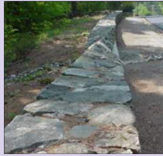
Just a rock wall you say? Take a closer look... Seacoast of New Hampshire.

More pictures on this topic to be featured in the next issue!