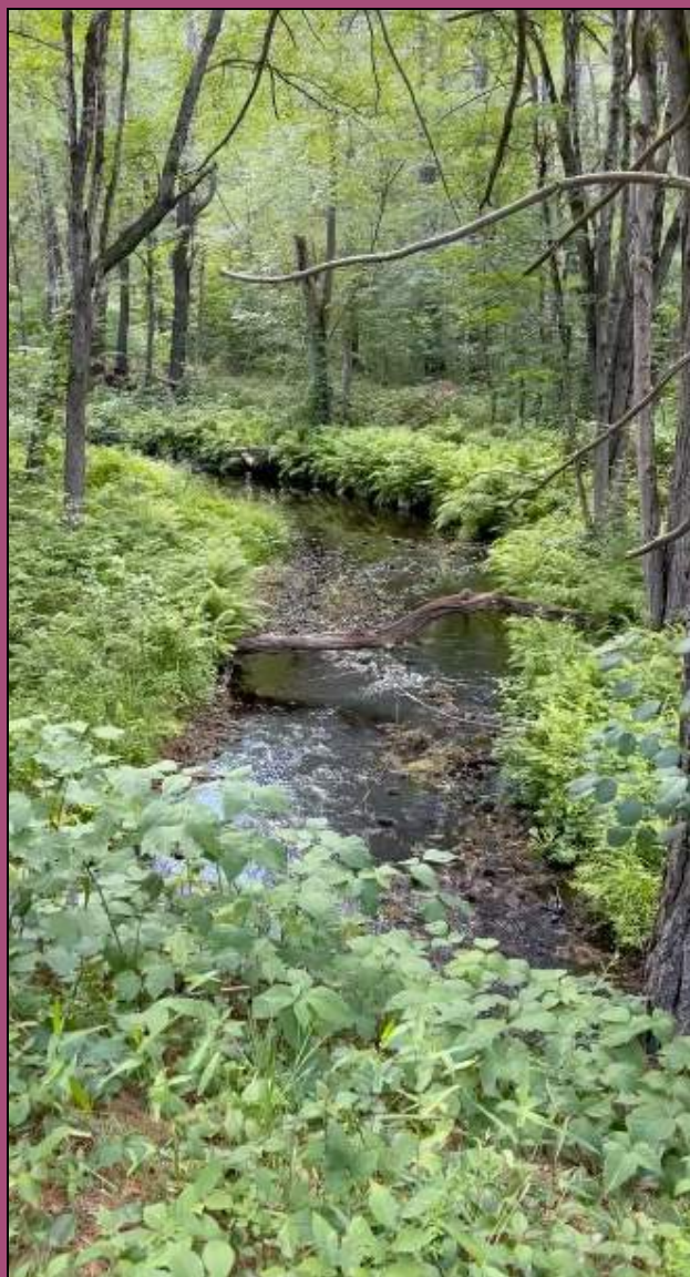
East Weare.

An occasional column featuring readers' reverent observations of our natural surroundings