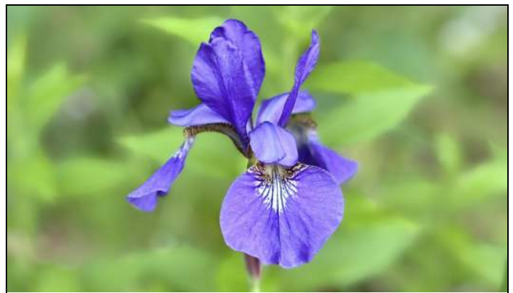
Wildflower.

6:30 p.m. – Friends of the Weare Public Library meeting