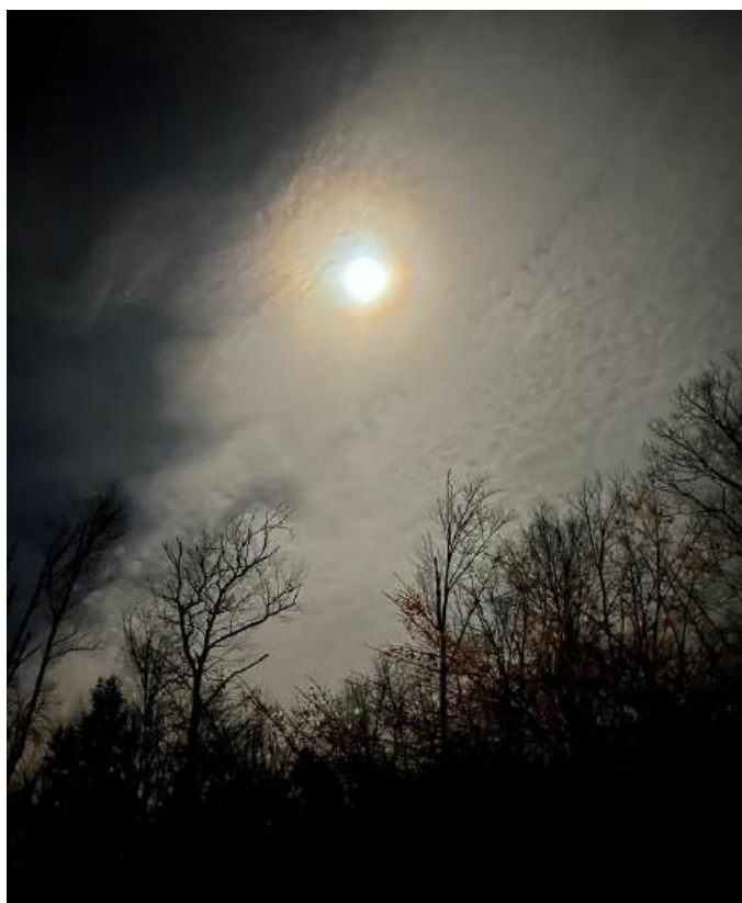
Full moon woods walk.