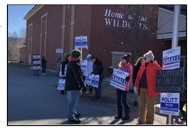
Voters and candidates meet outside WMS on Election Day.

Article two on the ballot related to a change in the Town of Weare Zoning Ordinance proposed by the Planning Board. All