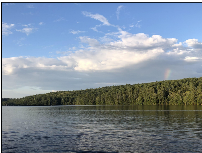
A partial rainbow peeks out of the clouds over Horace Lake on a recent summer afternoon